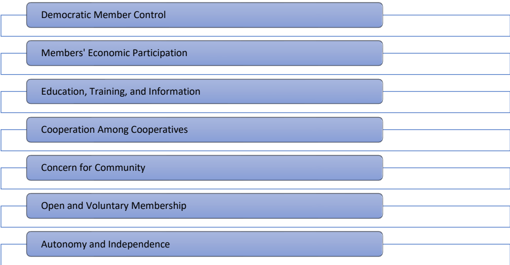
Figure 1: Principles of Cooperatives

Concern for Community: Cooperatives work for the sustainable development of their communities through policies approved by their members.