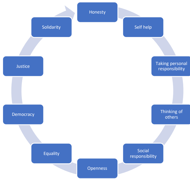
Figure 2: Values of Cooperatives